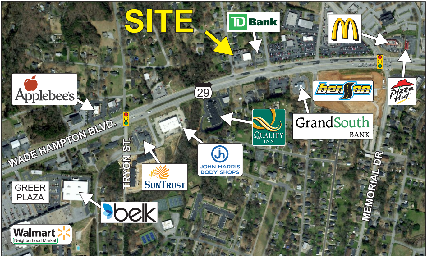
TAX MAP G019.00-01-042.00